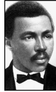
Robert Brown Elliott U.S. Representative, 1871–1874 Republican from South Carolina

— REPRESENTATIVE GEORGE HENRY WHITE Black Americans in Congress , page 228