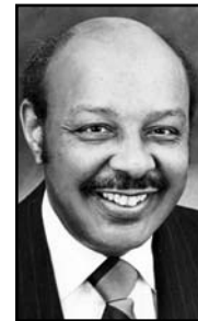
Louis Stokes U.S. Representative, 1969–1999 Democrat from Ohio