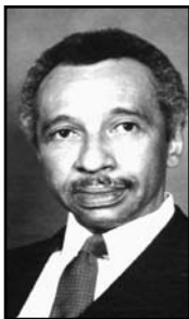
Parren James Mitchell U.S. Representative, 1971–1987 Democrat from Maryland

— REPRESENTATIVE SHIRLEY A. CHISHOLM Black Americans in Congress , page 239