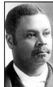
George Henry White U.S. Representative, 1897–1901 Republican from North Carolina