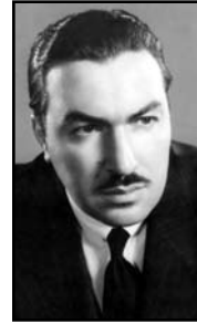
Adam Clayton Powell, Jr. U.S. Representative, 1945–1967; 1967–1971 Democrat from New York

— REPRESENTATIVE ADAM CLAYTON POWELL, JR. Black Americans in Congress , page 261