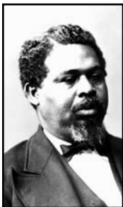
Robert Smalls U.S. Representative, 1875–1879; 1882–1883; 1884–1887 Republican from South Carolina

— REPRESENTATIVE RONALD V. DELLUMS Black Americans in Congress , page 420