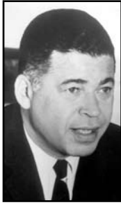
Edward William Brooke III United States Senator, 1967–1979 Republican from Massachusetts

“In every regard, we were treated as second-class soldiers, if not worse, and we were angry. I felt a personal frustration and bitterness I had not known before in my life.”