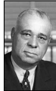
Arthur Wergs Mitchell U.S. Representative, 1935–1943 Democrat from Illinois

— REPRESENTATIVE ARTHUR WERGS MITCHELL Black Americans in Congress , page 288