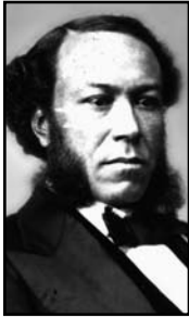
Joseph Hayne Rainey U.S. Representative, 1870–1879 Republican from South Carolina

“We [Black Americans] are earnest in our support of the Government. We are earnest in the house of the nation’s perils and dangers; and now, in our country’s comparative peace and tranquility, we are earnest for our rights.”