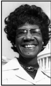
Shirley A. Chisholm U.S. Representative, 1969–1983 Democrat from New York

— SENATOR EDWARD WILLIAM BROOKE III Black Americans in Congress , page 332