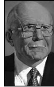
Augustus Freeman (Gus) Hawkins U.S. Representative, 1963–1991 Democrat from California