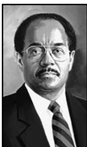
William Herbert (Bill) Gray III U.S. Representative, 1979–1991 Democrat from Pennsylvania

— REPRESENTATIVE PARREN JAMES MITCHELL Black Americans in Congress , page 434