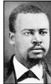
John Adams Hyman U.S. Representative, 1875–1877 Republican from North Carolina

— REPRESENTATIVE JOHN ADAMS HYMAN Black Americans in Congress , page 128