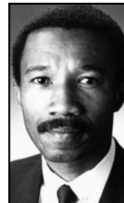
Kweisi Mfume U.S. Representative, 1987–1996 Democrat from Maryland

— REPRESENTATIVE KWEISI MFUME Black Americans in Congress , pages 571–572